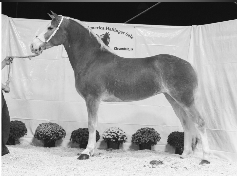
Sale topper Emma's Treasure WFHIL