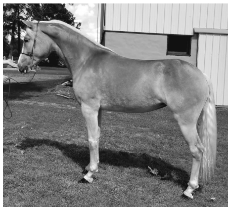
Two-Year-Old Sport Champion: Ricochet of Genesis