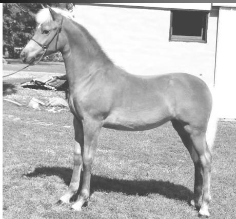
Weanling Sport Champion: A Diva of Genesis