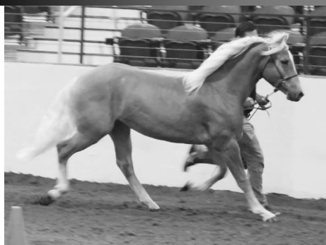
Yearling Sport Champion: Avalon of Genesis