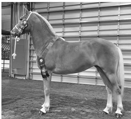
Two-Year-Old Hitch Champion: Welcome Addition