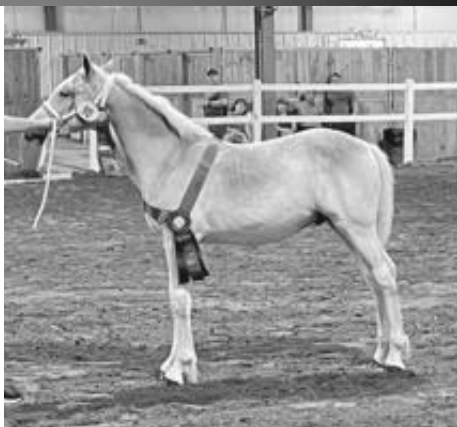
Weanling Hitch Champion: Waylon MBRO